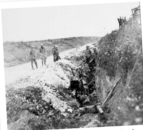
Newfoundland soldiers waiting in St. John’s Road support trench

The more cards you collect, the more likely it is to find a Heart. Those who find a Heart beat the odds, just like the soldiers who made roll call on July 2, 1916.