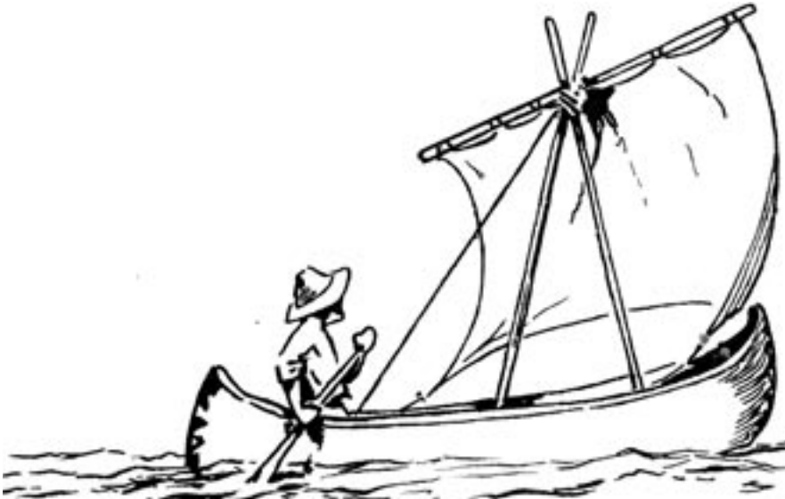
© The Scout Association / Sketch by Baden Powell

"A Lady Cubmaster was teaching a Cub Natural History, and asked him: "What is a rabbit covered with - is it hair, or wool, or fur, or what". The Cub replied: "Good gracious, Akela, haven't you ever seen a rabbit?"