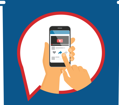
Youth age 15–24 sign petitions, attend demonstrations, and share their views on social media more than any other age group in Canada.