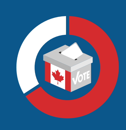
In the last federal election, 66% of eligible voters cast their ballot.