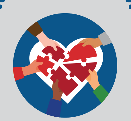
What needs to be changed in your community for it to be 100% peaceful?

What does a peaceful world look like to you? What does peace mean to you?